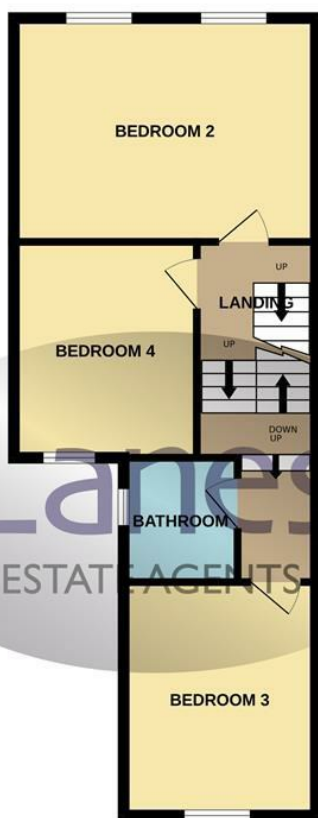
1ST FLOOR 512 sq.ft. (47.5 sq.m.) approx.