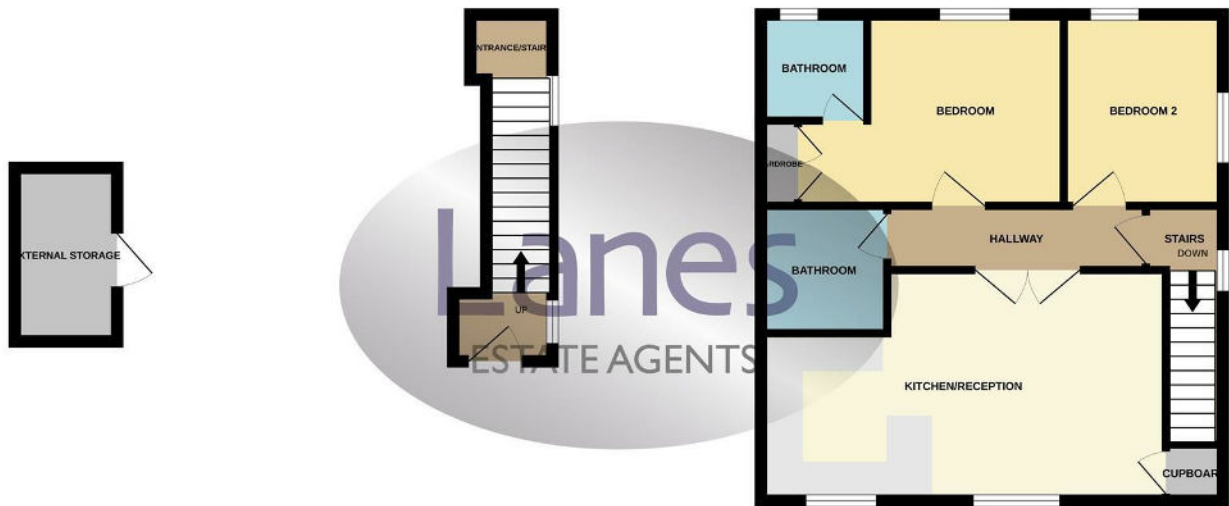
FIRST FLOOR 500 sq.ft. (46.5 sq.m.) approx.

TOTAL FLOOR AREA : 572sq.ft. (53.1 sq.m.) approx.