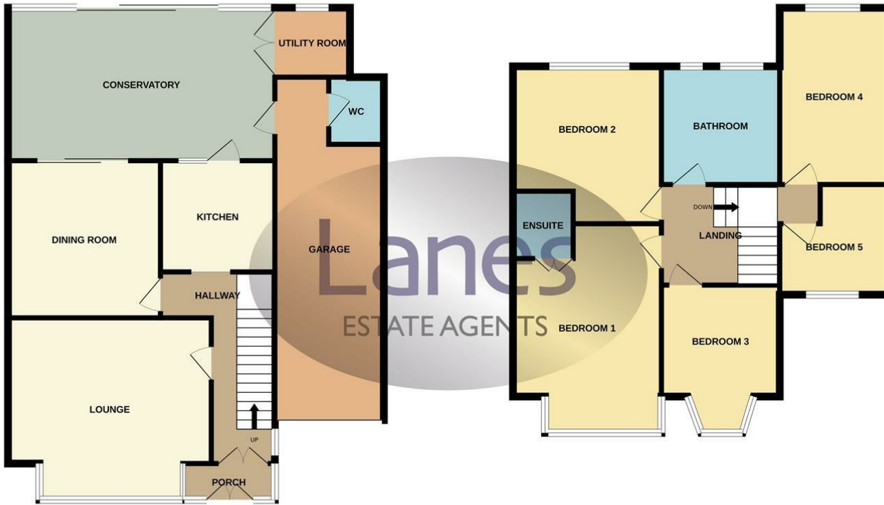
TOTAL FLOOR AREA: 1735 sq.ft. (161.2 sq.m.) approx.

Whilst every attempt has been made to ensure the accuracy of the floorplan contained here, measurements of doors, windows, rooms and any other items are approximate and no responsibility is taken for any error, omission or mis-statement. This plan is for illustrative purposes only and should be used as such by any prospective purchaser. The services, systems and appliances shown have not been tested and no guarantee as to their operability or efficiency can be given. Made with Metropix ©2024