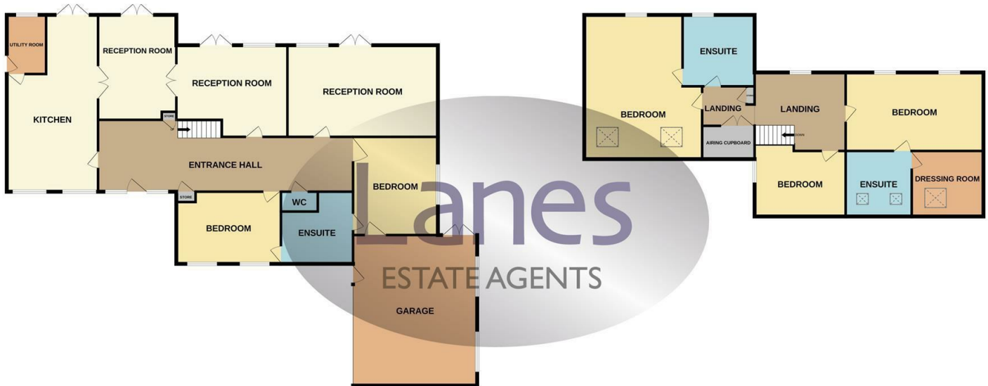
1ST FLOOR 1343 sq.ft. (124.8 sq.m.) approx.

TOTAL FLOOR AREA : 3758 sq.ft. (349.2 sq.m.) approx.