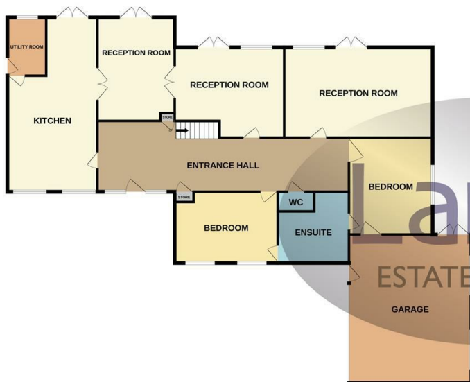
GROUND FLOOR 2416 sq.ft. (224.4 sq.m.) approx.