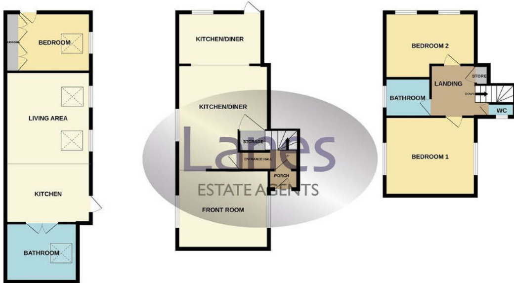
FIRST FLOOR 429 sq ft. (39.6 sq.m.) approx.

TOTAL FLOOR AREA: 1466 sq.ft. (136.2 sq.m.) approx. Whilst every attempt has been made to ensure the accuracy of the floorplan contained here, measurements of doors, windows, rooms and any other items are approximate and no responsibility is taken for any error, omission or mis-statement. This plan is for illustrative purposes only and should be used as such by any prospective purchaser. The services, systems and appliances shown have not been tested and no guarantee as to their operability or efficiency can be given. Made with Metropix ©2024