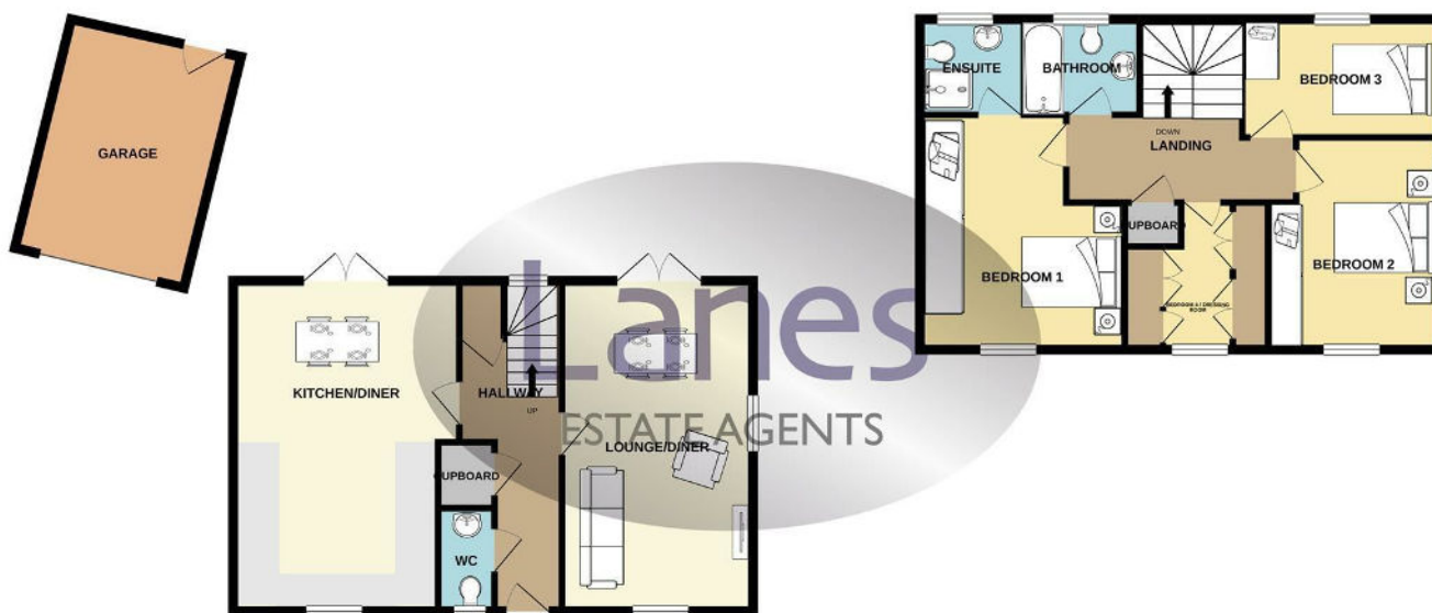
1ST FLOOR 596 sq.ft. (55.4 sq.m.) approx.

TOTAL FLOOR AREA: 1336 sq.ft. (124.1 sq.m.) approx.