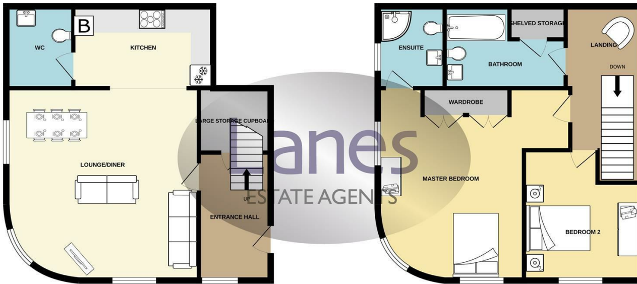
TOTAL FLOOR AREA : 1165 sq.ft. (108.2 sq.m.) approx.

Whilst every attempt has been made to ensure the accuracy of the floorplan contained here, measurements of doors, windows, rooms and any other items are approximate and no responsibility is taken for any error, omission or mis-statement. This plan is for illustrative purposes only and should be used as such by any prospective purchaser. The services, systems and appliances shown have not been tested and no guarantee as to their operability or efficiency can be given. Made with Metropix ©2023