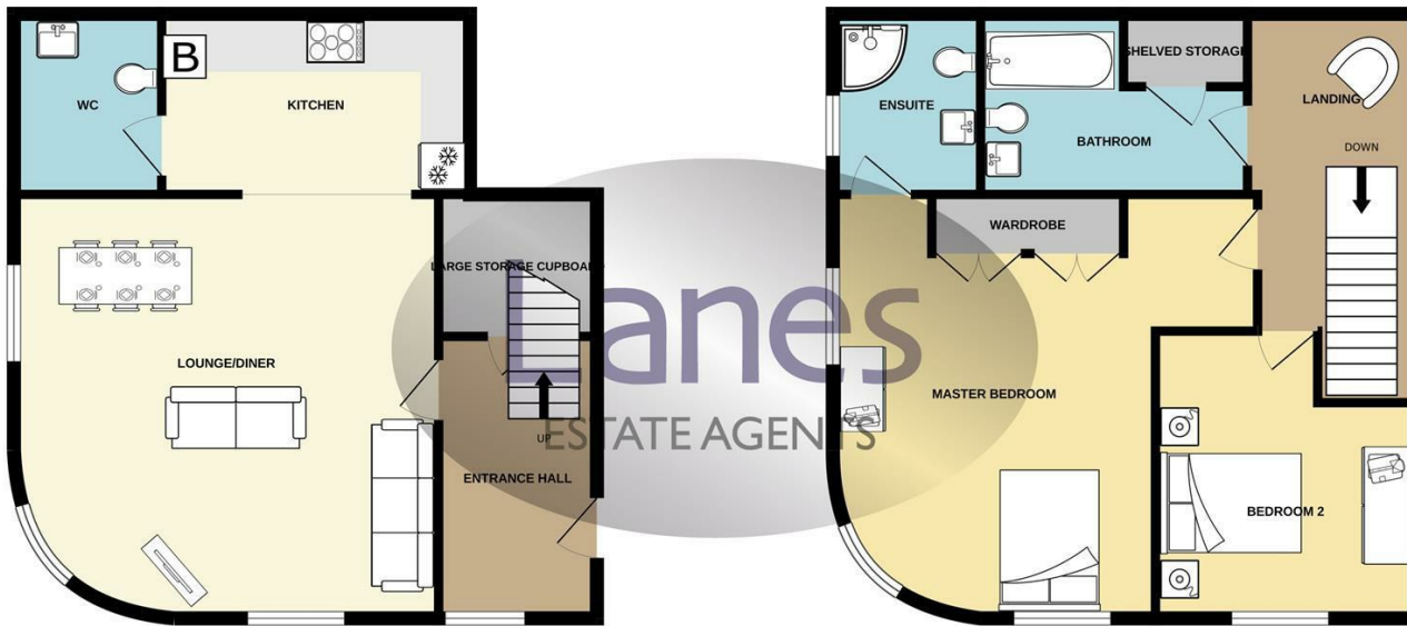
TOTAL FLOOR AREA : 1165 sq.ft. (108.2 sq.m.) approx.

Whilst every attempt has been made to ensure the accuracy of the floorplan contained here, measurements of doors, windows, rooms and any other items are approximate and no responsibility is taken for any error, omission or mis-statement. This plan is for illustrative purposes only and should be used as such by any prospective purchaser. The services, systems and appliances shown have not been tested and no guarantee as to their operability or efficiency can be given. Made with Metropix ©2023