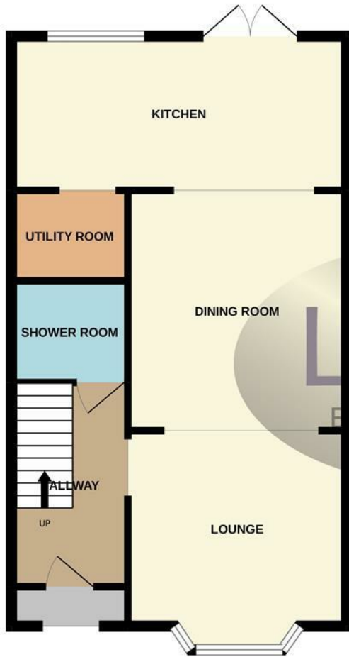
GROUND FLOOR 556 sq.ft. (51.6 sq.m.) approx.