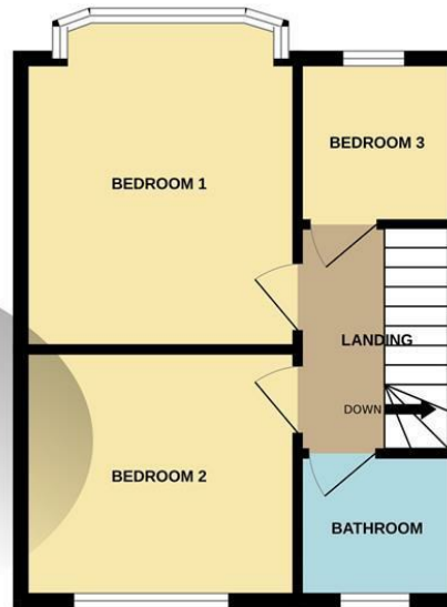
1ST FLOOR 349 sq.ft. (32.4 sq.m.) approx.