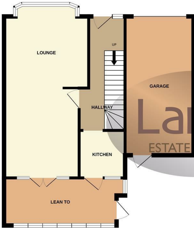
GROUND FLOOR 633 sq.ft. (58.8 sq.m.) approx.