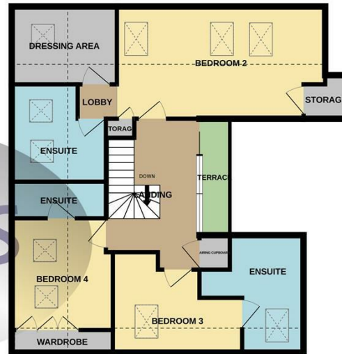
TOP FLOOR 779 sq.ft. (72.4 sq.m.) approx.