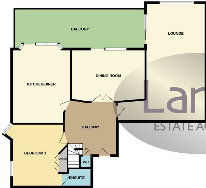
GROUND FLOOR 1077 sq.ft. (100.1 sq.m.) approx.