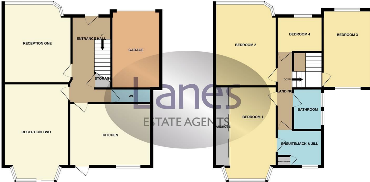
1ST FLOOR 720 sq.ft. (66.9 sq.m.) approx.

TOTAL FLOOR AREA : 1545 sq.ft. (143.5 sq.m.) approx.