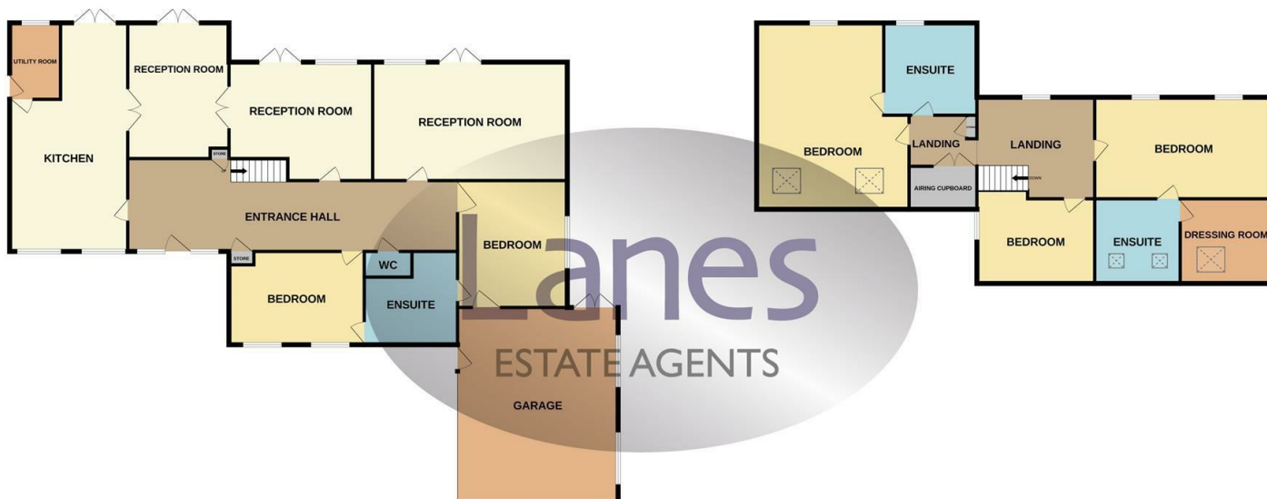
1ST FLOOR 1343 sq.ft. (124.8 sq.m.) approx.

TOTAL FLOOR AREA : 3758 sq.ft. (349.2 sq.m.) approx.