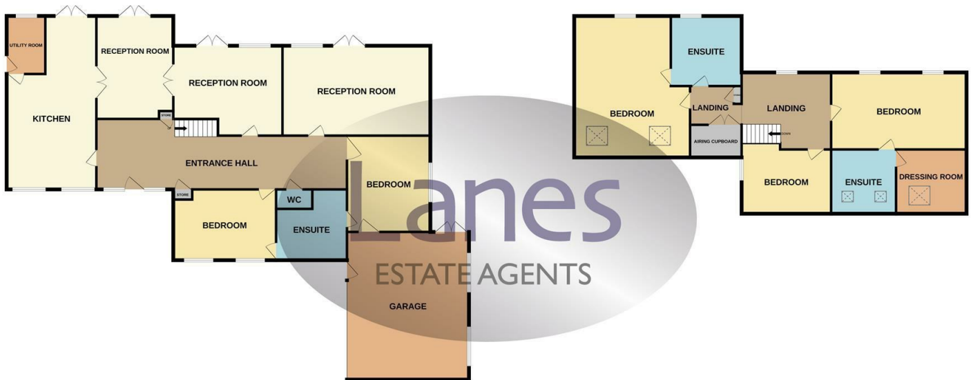
1ST FLOOR 1343 sq.ft. (124.8 sq.m.) approx.

TOTAL FLOOR AREA : 3758 sq.ft. (349.2 sq.m.) approx.